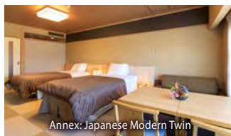
Annex: Japanese Modern Twin

Spend a blissful time embraced by the seasonal breeze