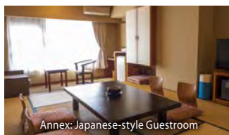
Annex: Japanese-style Guestroom