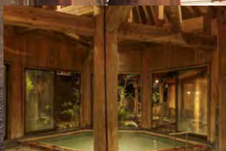
[Nurisawa-no-yu Hot Spring] Indoor bath

The Garden Jomon-style Bath, built in the year 2001, is inspired by the precious archaeological site Shidanai Ruins, located to the west of the Tsunagi Hot Springs. Its pleasant atmosphere is reminiscent of the ancient Jomon period.