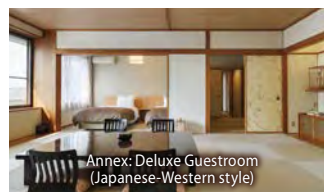
Annex: Deluxe Guestroom (Japanese-Western style)