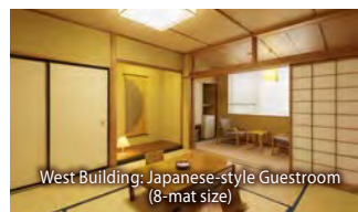
West Building: Japanese-style Guestroom (8-mat size)