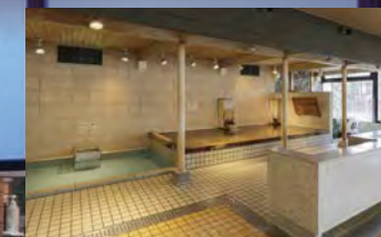
[Ai-no-yu Hot Spring] Tourmaline, natural cypress, panda, and kappa character baths

Magokoro-no-yu and Ai-no-yu Hot Springs each have five unique baths including a spacious public bathing area, a cypress bath, a sauna, and more, so you can enjoy bath-hopping.