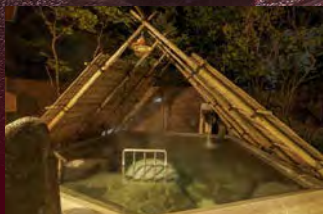
[Shidanai-no-yu Hot Spring] Stone Circle Hot Spring (Open-air)