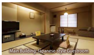
Main Building: Japanese-style Guestroom