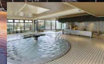
[Magokoro-no-yu Hot Spring] Public bathing area