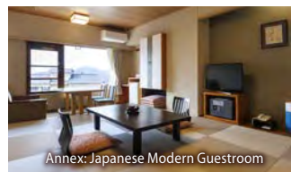
Annex: Japanese Modern Guestroom